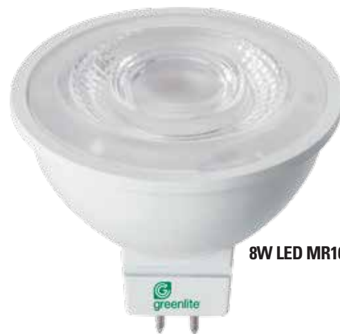
8W LED MR16