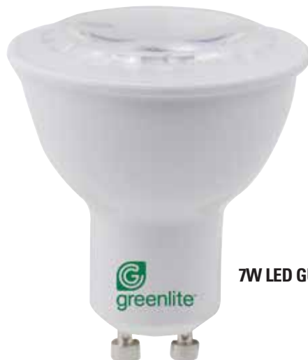
7W LED GU10