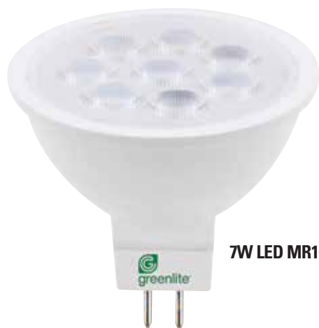
7W LED MR16